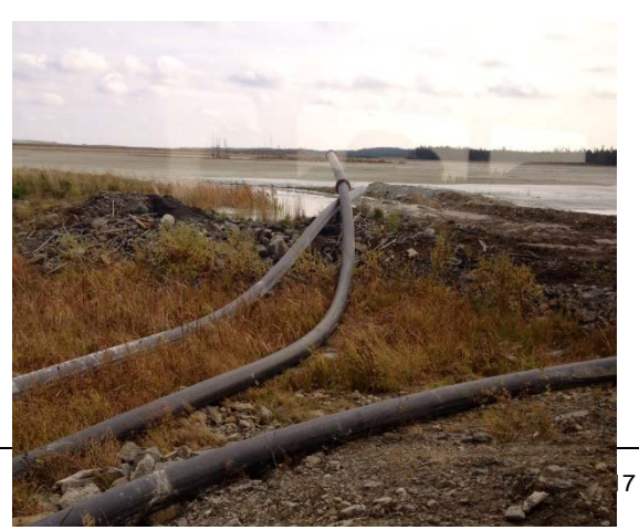
Figure 9: Photos of the Manitou-Goldex restoration site visit