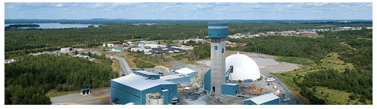
Figure 7: Agnico Eagle's Goldex facility

On the morning of October 2<sup>nd</sup>, the Panel toured Agnico Eagle's Goldex facility and the Goldex-Manitou restoration site.