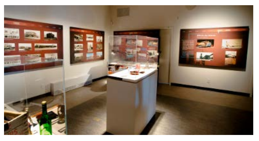
Figure 6: Photo of the Malartic Museum

Agnico Eagle arranged for a tour of the Malartic Museum for Panel members. The Malartic Museum is the only one in Quebec dedicated solely to geology and mineralogy. Jean Massicote, the tour guide, showed the Panel members the new 75<sup>th</sup> Anniversary of Malartic Exhibit, and provided each of the panel members with a book on the history of the region.