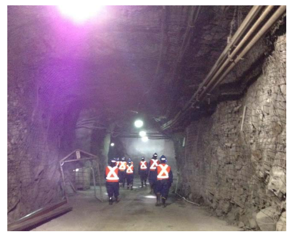
Figure 8: The COI Panel visiting the underground Goldex Mine (October 2, 2014)