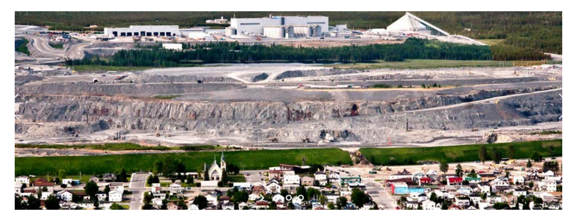
Figure 5: Photo of Canadian Malartic Mine, located beside the town of Malartic.