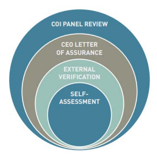
Figure 3: Levels of assurance in the TSM program

All companies selected for the PVR are asked to prepare a Company Background Document to help the Panel understand the company, the verified results, and any relevant background information prior to the Fall COI Panel Meeting.