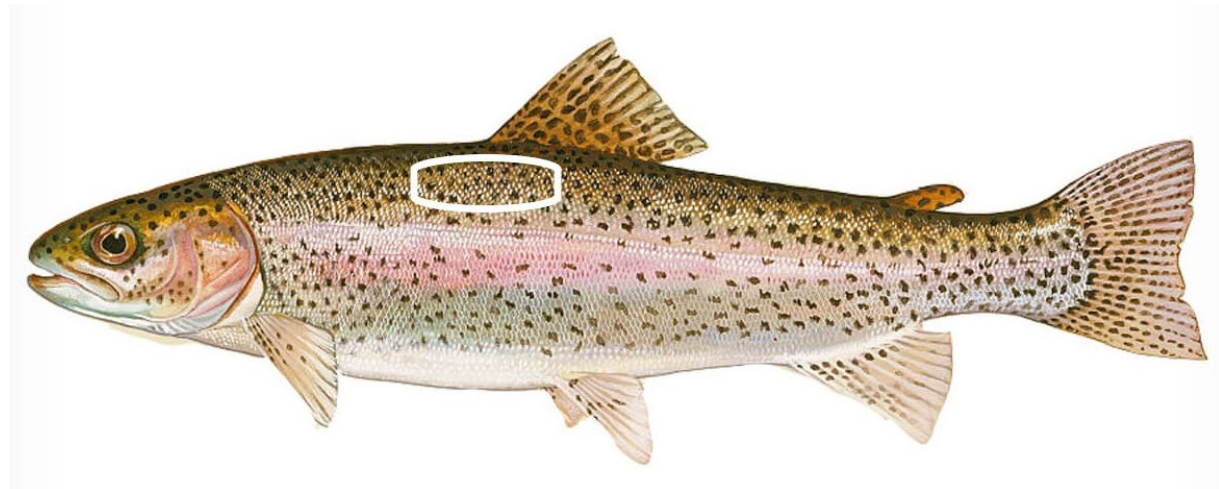
Figure 2: Recommend part of the fish to target for collection of muscle plugs.

If collection of muscle plugs is planned, practitioners may also refer to Baker et al. (2004). In addition, practitioners should contact the analytical laboratory in advance for any specific considerations related to muscle plug samples. Refer to Stahl et al. (2021) for further information.